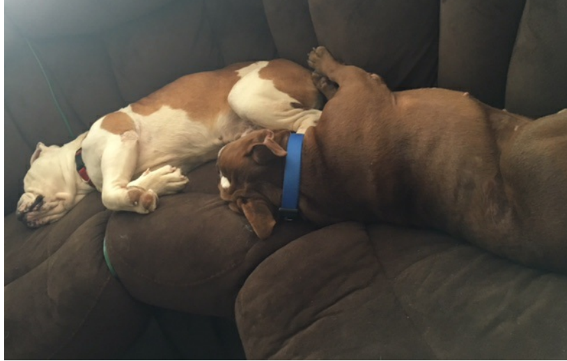
Spartan and Roman

You'd never know it by the photo, but these 2 handsome brothers were in bad shape when Paws In Need was notified. What started as two simple neuter surgeries, quickly turned into much more. They needed urgent care for a neglected skin condition. Additionally, it was discovered that one of these regal brothers had a perineal hernia and needed immediate surgery. Our "Just Like New" program came to the rescue! We also worked in tandem with Underdog Rescue, who agreed to take these boys into their "foster to adopt" program after they healed from their medical issues. Having spent 7 years outdoors, chained to a concrete patio, it was anyone's guess how these 2 would fare in a temperament evaluation. They passed and are as sweet and gentle as can be, soaking up all the attention and pampering they are getting! Re-named Spartan and Roman, these 2 gladiators are on their way to victory!