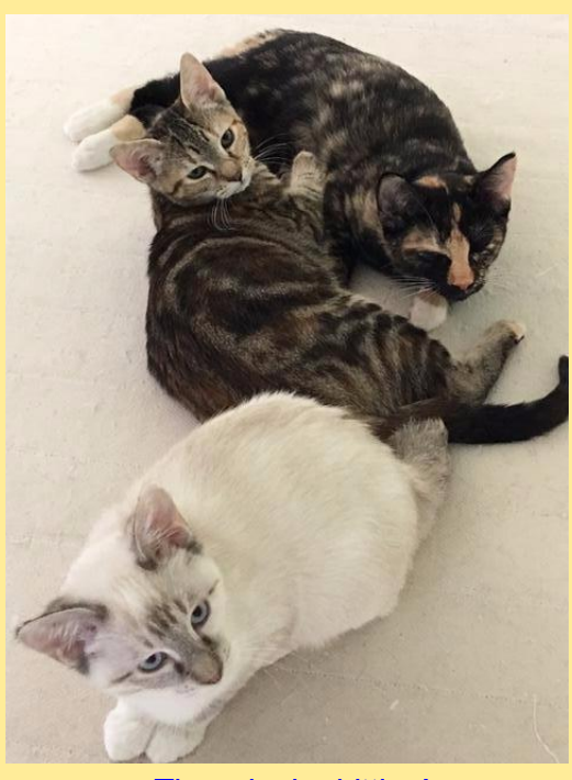
Three lucky kitties!

Whether known as a "tierce" in China, a "trio ordre" in France, or "trifecta" in the US, these