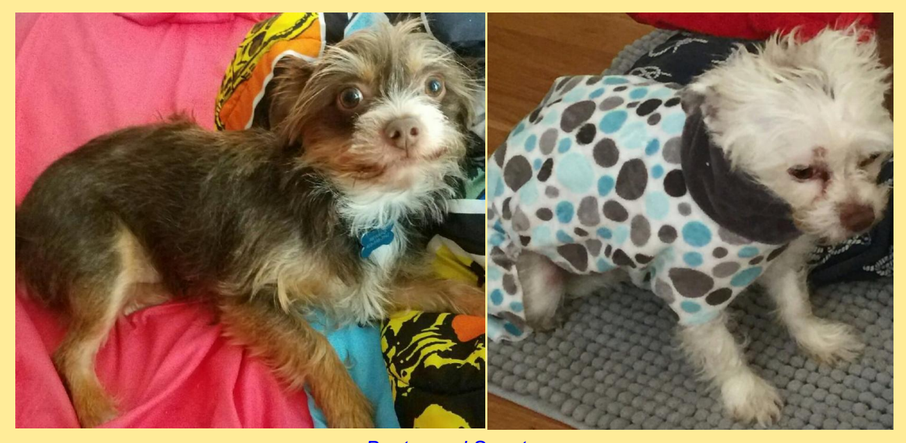
Buster and Scooter

These 2 little buddies were also found together as strays, roaming the streets, hungry and dirty. A Good Samaritan with dog fostering experience found them and tried locating their possible family in hopes they were just lost. After considerable time and realizing nobody was coming forward for these two, she contacted Paws in Need to utilize our low cost spay/neuter program to get them both fixed before finding them new homes.