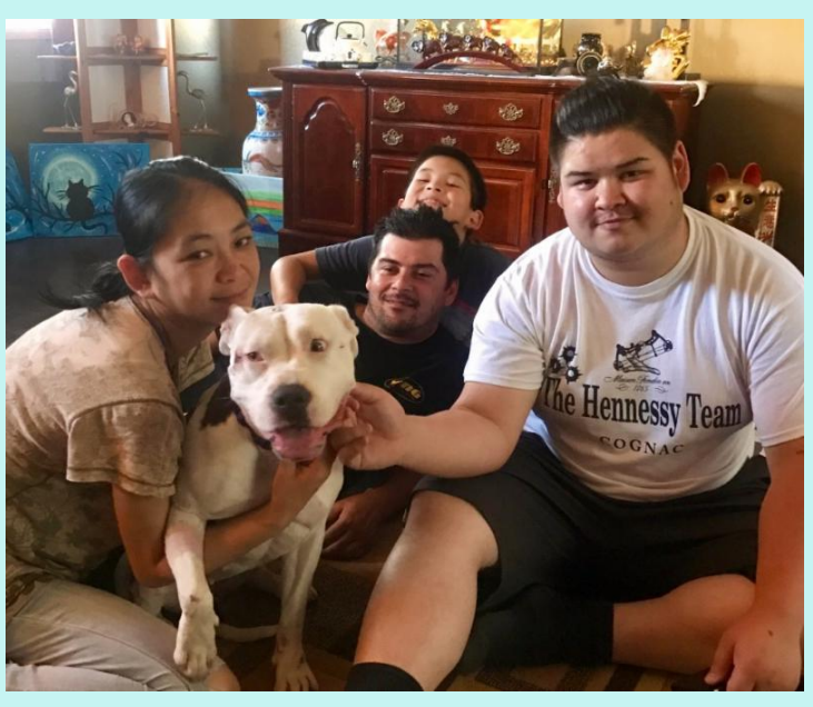
Belle and family

This princess has the right name considering how she is now pampered in her new castle. Belle had a rough start, found wandering in rural Livermore in an industrial park.