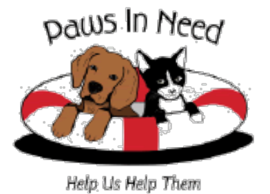
The Printed Paw Early Fall 2016