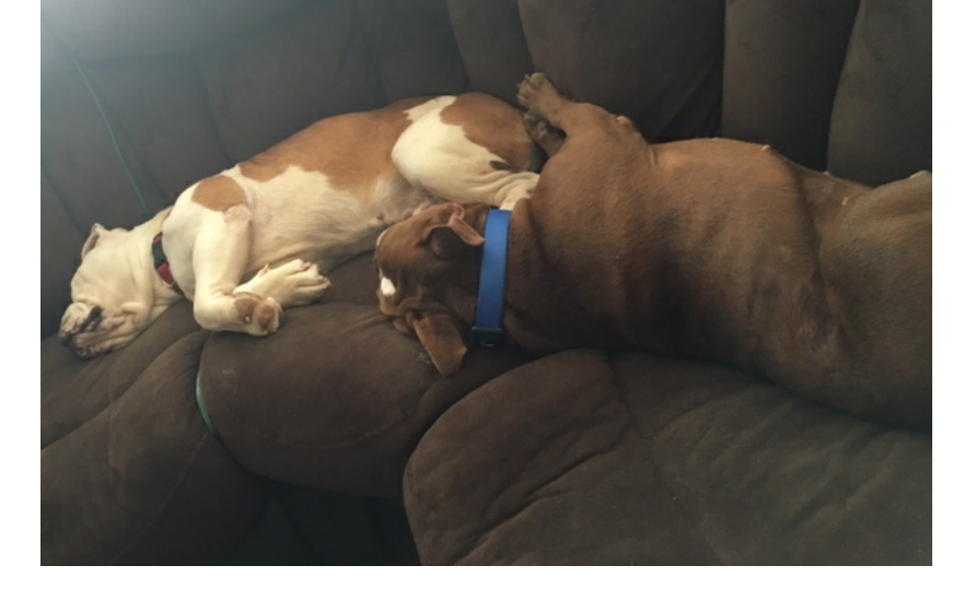
Spartan and Roman

You'd never know it by the photo, but these 2 handsome brothers were in bad shape when Paws In Need was notified. What started as two simple neuter surgeries, quickly turned into much more. They needed urgent care for a neglected skin condition. Additionally, it was discovered that one of these regal brothers had a perineal hernia and needed immediate surgery. Our "Just Like New" program came to the rescue! We also worked in tandem with Underdog Rescue, who agreed to take these boys into their "foster to adopt" program after they healed from their medical issues. Having spent 7 years outdoors, chained to a concrete patio, it was anyone's guess how these 2 would fare in a temperament evaluation. They passed and are as sweet and gentle as can be, soaking up all the attention and pampering they are getting! Re-named Spartan and Roman, these 2 gladiators are on their way to victory!