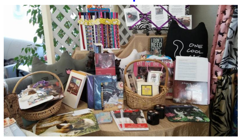
Paws In Need Animal Boutique

The Paws In Need Animal Boutique located inside the lobby at Feline Medical Center, 3160 Santa Rita Rd, Pleasanton has very unique gifts for animals and the people who love them. Drop by week days between 8am and 6pm to find that purrfect gift. Newly made adorable cat and dog cards are now available.