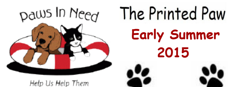
Early Summer 2015